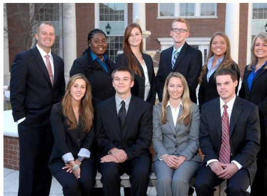
Wall Fellows Class of 2013