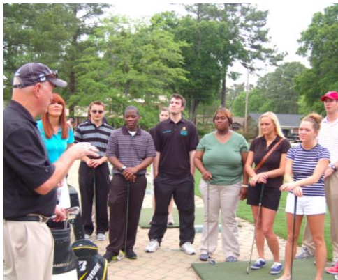
Wall Fellows on Hackler Golf Course during annual retreat