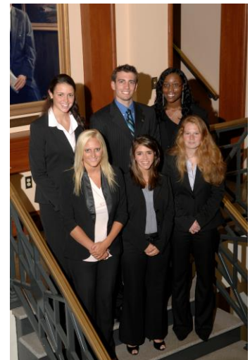
Wall Fellows Class of 2014