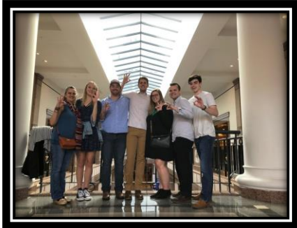
Wall Fellows at Texas State Capitol.