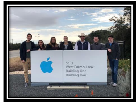
Wall Fellows at the Apple campus.

The same day, they were able to take a city tour that taught them more about the history and culture of Austin. One of the amazing things they learned was the history of Juneteenth. They were also able to learn about other traditions at the George Washington Carver Museum. The Texas State History Museum taught them about the rodeo and music created in Texas.