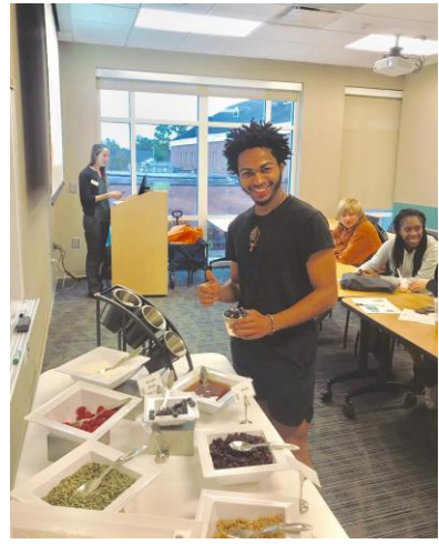
Teal Goes Pink volunteer

To learn more about Teal Goes Pink, follow on Facebook at facebook.com/TealGoesPink.