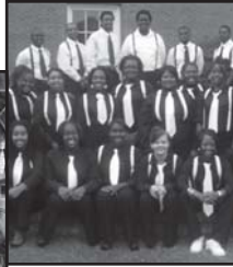
Gospel Sing Out featuring the Coastal Carolina University Inspirational Ambassadors Sunday, March 8