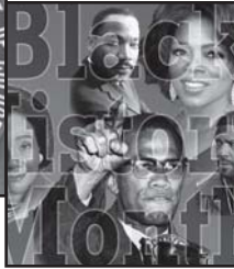
Black History Program Thursday, Feb. 19