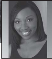
Our Voice: A celebration of Black Women in Music Wednesday, March 25