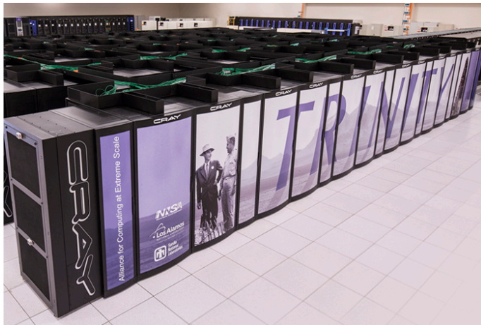
Trinity Supercomputer @ LANL

CLAMR: US DOE Hydrodynamics Proxy Application