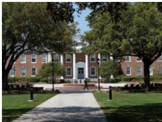
Coastal Carolina University