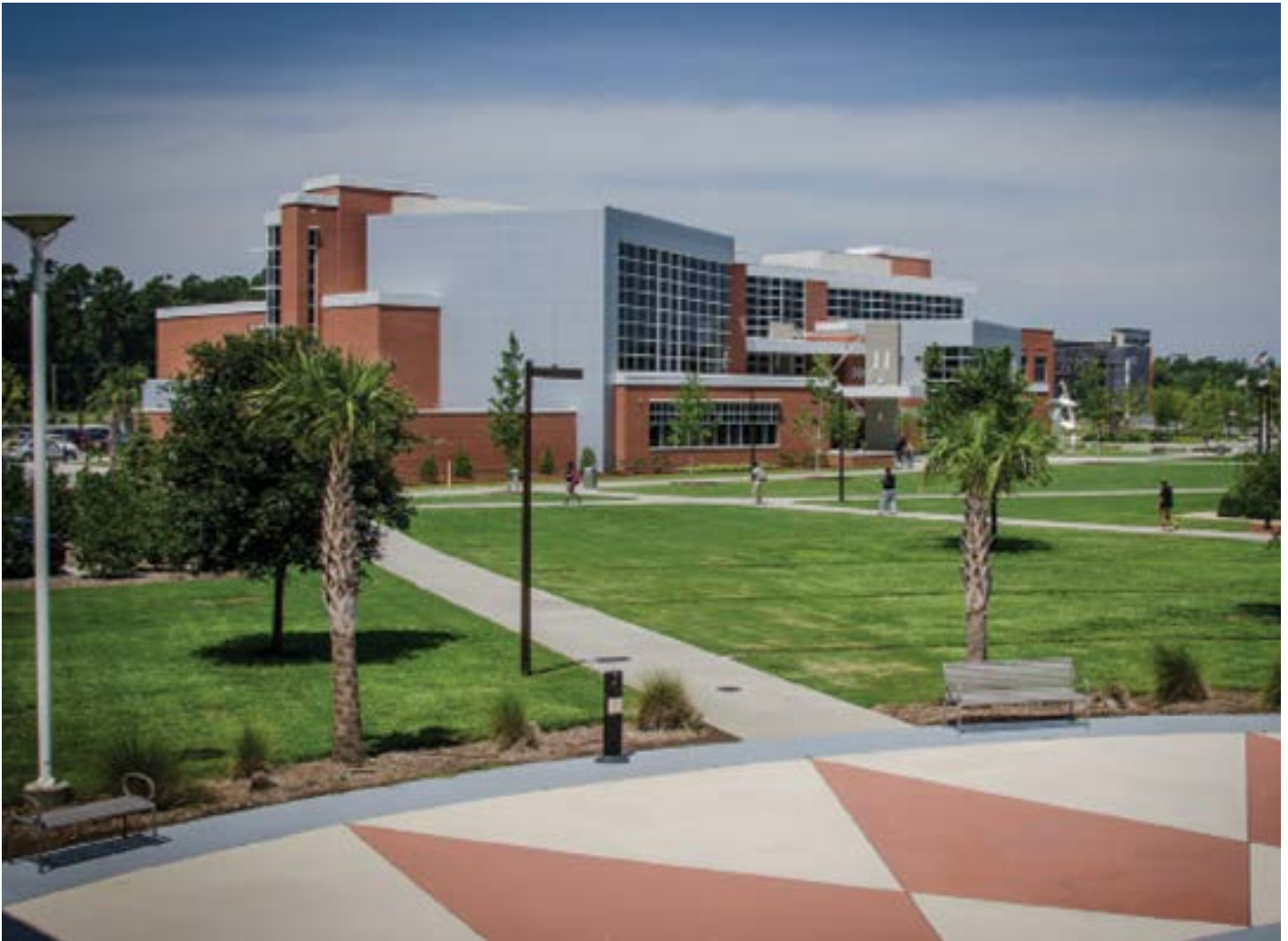
Horry Georgetown Technical College (Conway)