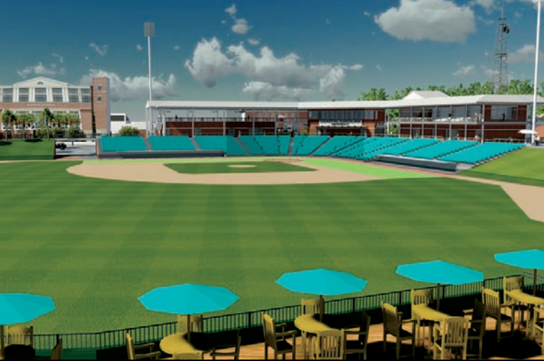
WATSON STADIUM / VROOMAN FIELD