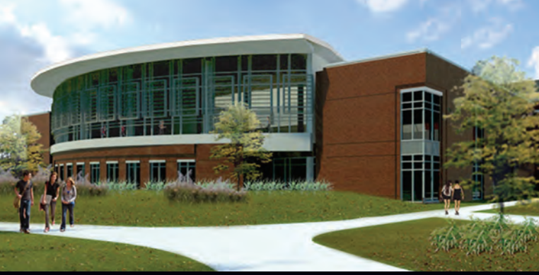
STUDENT RECREATION / CONVOCATION CENTER