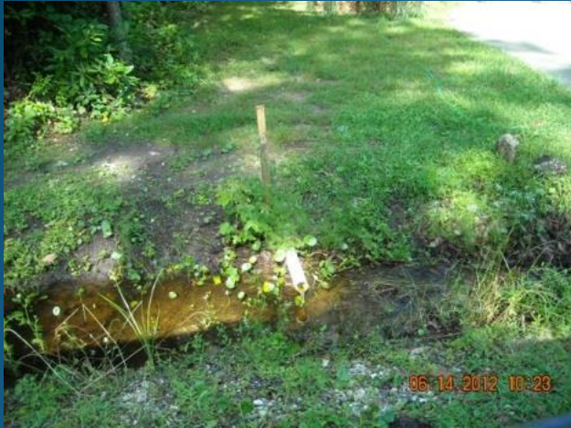
Illegal Pipe Connection