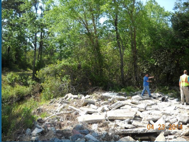
Illegal Wetland Fill